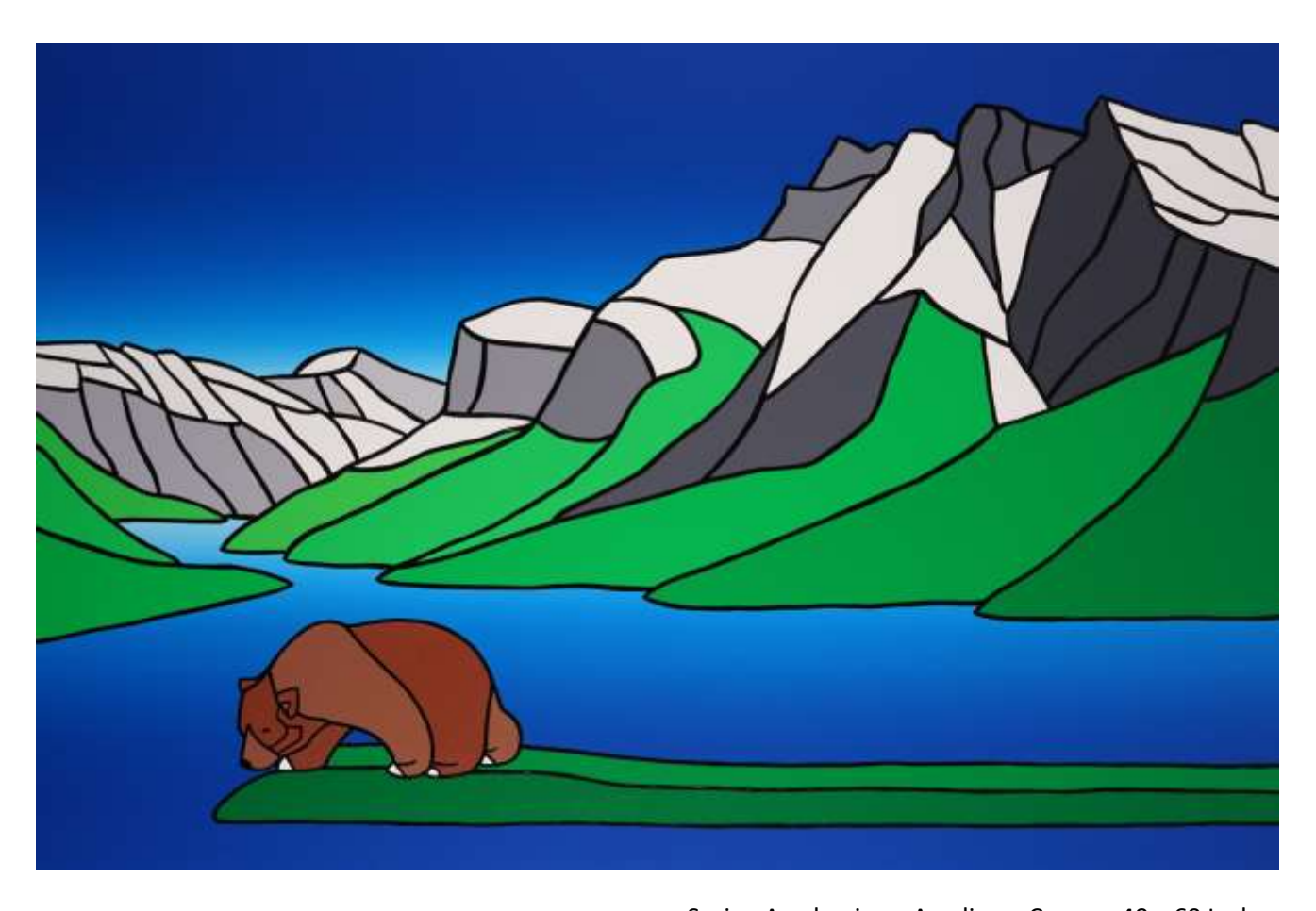
Spring Awakenings, Acrylic on Canvas, 40 x 60 Inches

Description : "Spring, a time for new life and renewal; of playful discovery and bursts of colour and joy. This time of awakening, filled with brilliant colours and rejuvenation, is perhaps one of my favourite themes to explore in stone and canvas. Pure joy and pure playfulness, much like the season." – Jason Carter